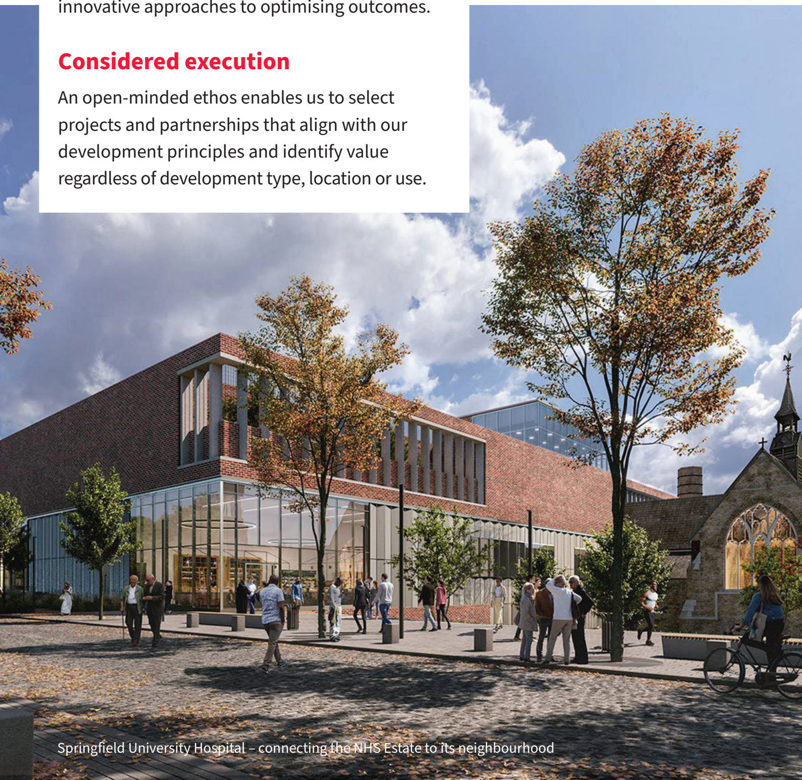
Springfield University Hospital – connecting the NHS Estate to its neighbourhood

An open-minded ethos enables us to select projects and partnerships that align with our development principles and identify value regardless of development type, location or use.