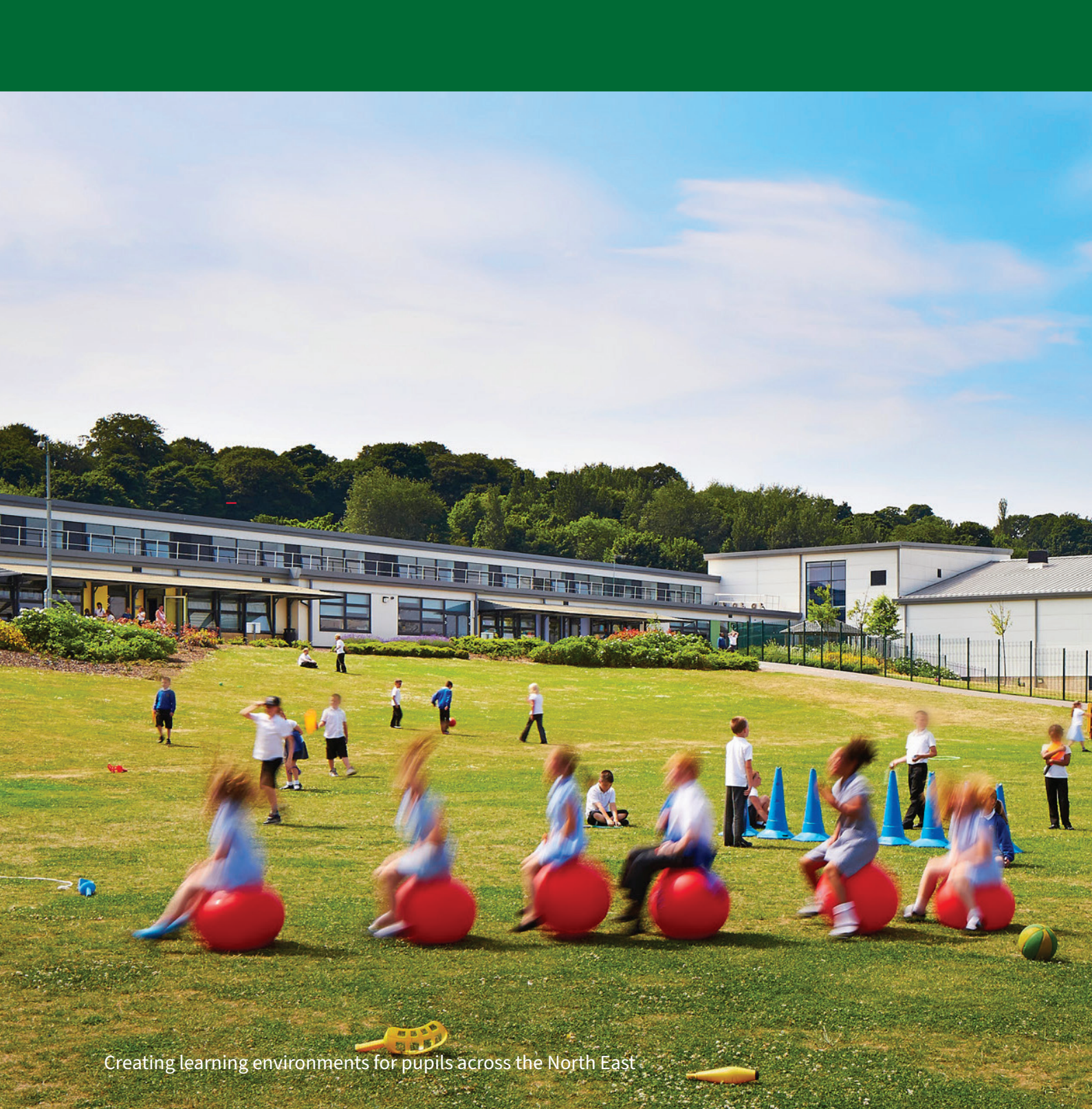
Creating learning environments for pupils across the North East