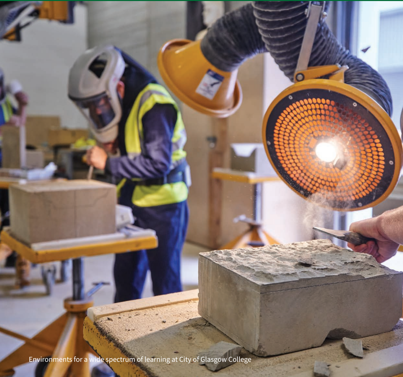
Environments for a wide spectrum of learning at City of Glasgow College