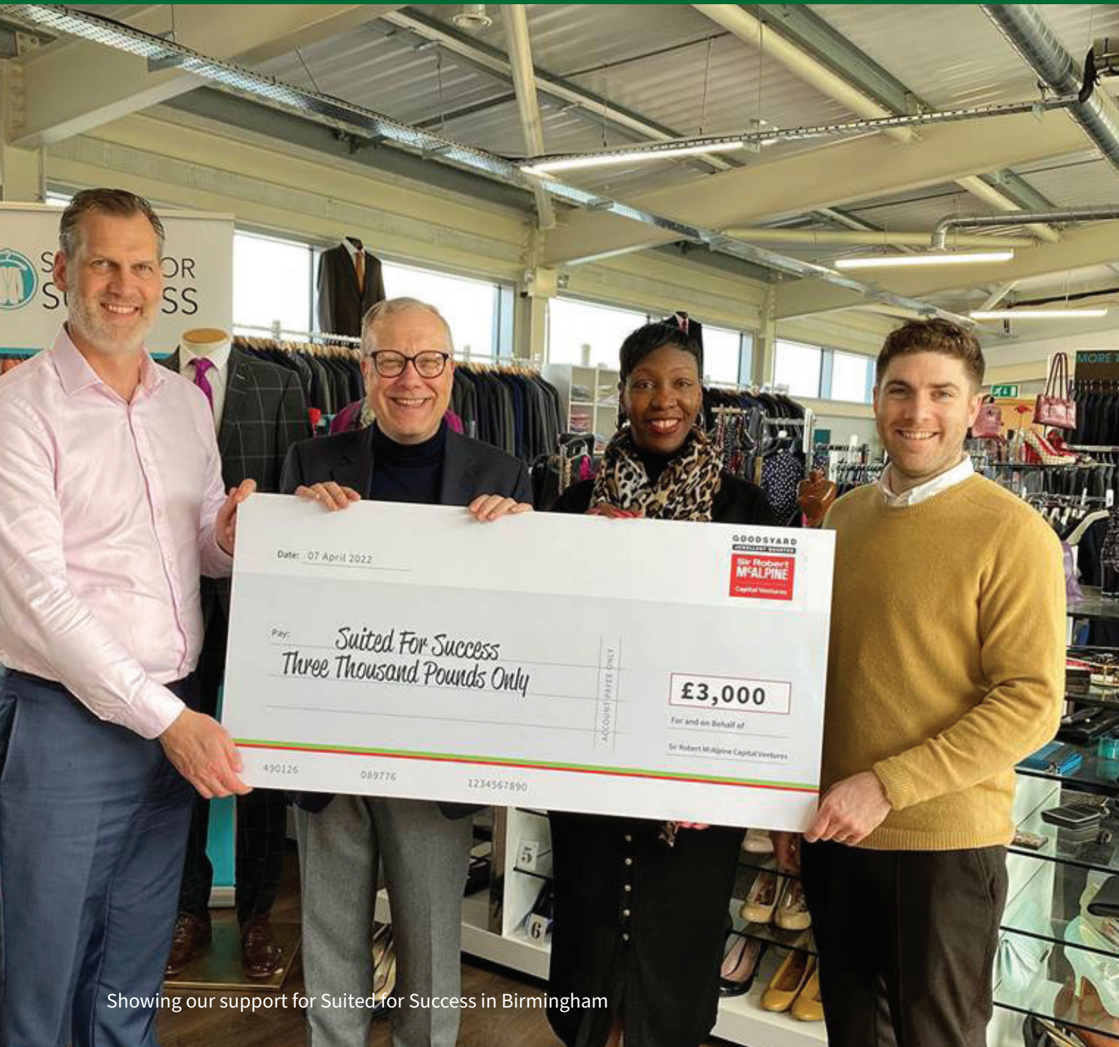
Showing our support for Suited for Success in Birmingham